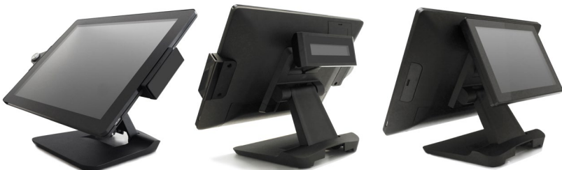
Modular design peripherals for easy serviceability