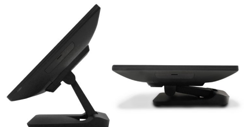
High flexibility with foldable stand